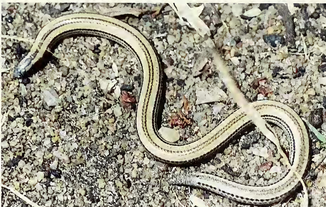
FIGURE 3. Typhlacontias kataviensis : paratype CAS 231982 from Jaribu Mtgao, Katavi National Park. Note the lack of stripes on the regenerated portion of the tail.

OTHER MATERIAL EXAMINED. — Typhlacontias gracilis : ZAMBIA: Kabompo Boma (1324C1) NMZB 501, 2822, 3405–6, 4967; Kalabo (1422D3) NMZB–UM 4811–4, 6768, 6770–9, 6781, 6783–5, 6789–90, 6792, 6794, 6796–9, 7870–99, 10049, 10051, 10055–60, 21032, 21034–42, 21044–50, 21052–7, 21059–60, 21062–8, 21070–96, 21098–21103, 21105–16, 21118–43, 21145–8, 21150; Lealui (1523A1) MNHN 20.89–95 (type series); 8 km NE of Mongu (1523A1) NMZB 15983–4; Ndau School (1522B4) NMZB 15986–8, 16023–6, 16044.